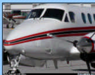
Beech King Air